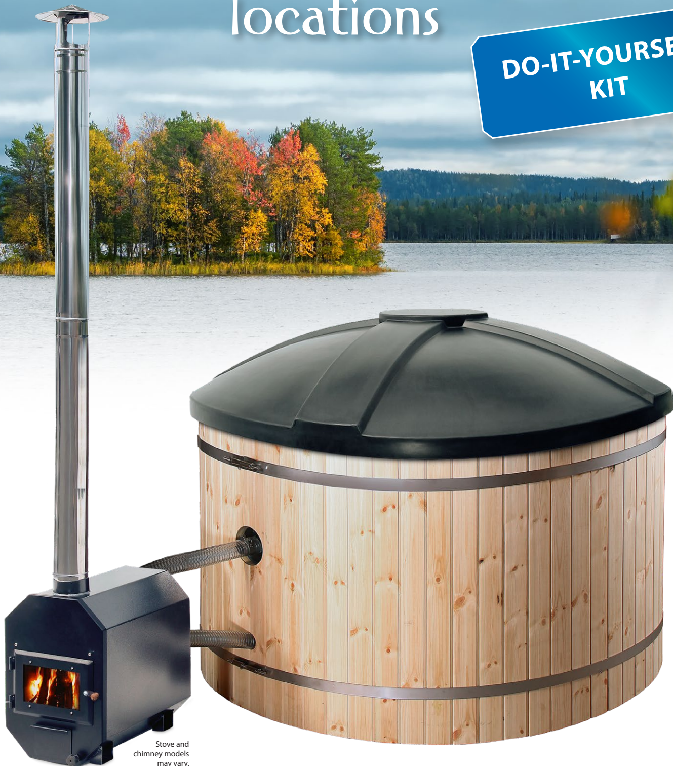
Stove and chimney models may vary.