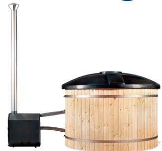
The model of the stove and chimney may vary.